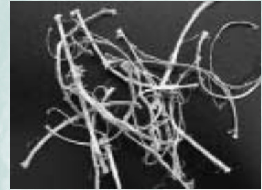
Tuf-Strand SF™ Fibers

• EUCOSHOT D-A – a dry, multipurpose admixture designed to accelerate the normal setting rate of shotcrete, increase strength development at all ages and improve workability.